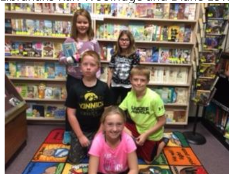
Another group of winners from a Wednesday Night Promiseland/Library Jeopardy game