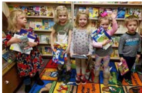
3 & 4 year olds - Jeopardy winners

1 Corinthians 15:57 Thanks be to God! He gives us the victory through our Lord Jesus Christ.