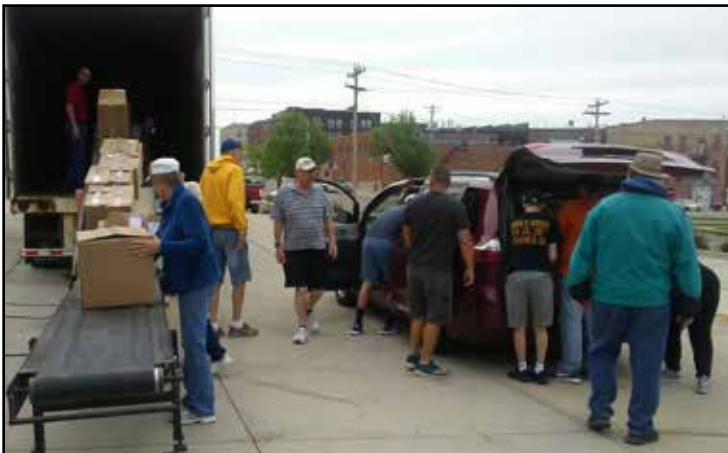
Mission quilts and kits making their way from Immanuel to Albert Lea