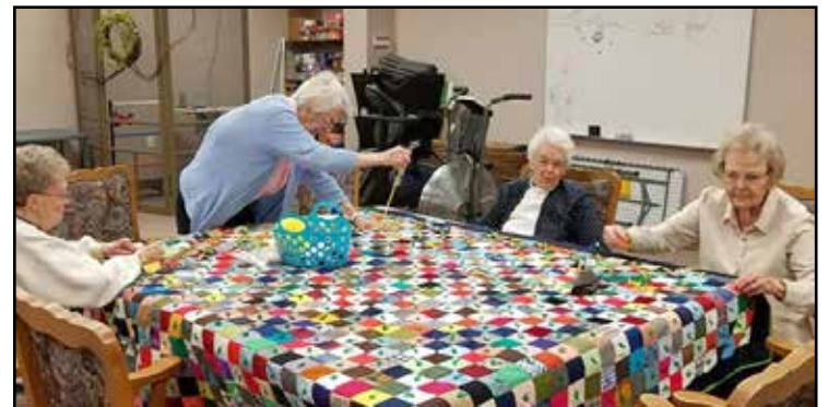
Forest Plaza residents helping out by tying quilts