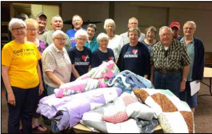
Packing Day work crew