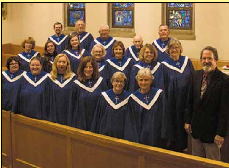
The Immanuel Choir has had a fun season of singing God's praises! Join us in the Fall, first rehearsal Wednesday, Sept. 5th, 7:30-8:45 pm.